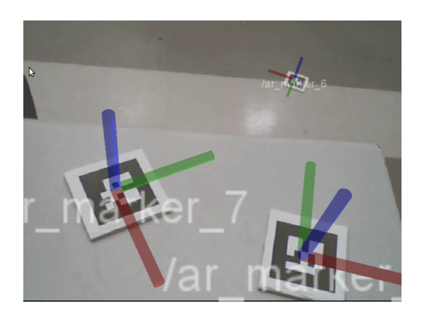
Figure 3: Tracking AR Tags with webcam

From the Displays panel in RViz, add an "Image" display. Set the Image Topic of the Image Display to the appropriate topic (/usb_cam/image_raw for the starter project), and set the Global Options Fixed Frame to usb_cam. (Note: you may need to place an AR tag in the field of view of the camera to cause the usb_cam frame to appear.) You should now see a docked window with the live feed of the webcam.