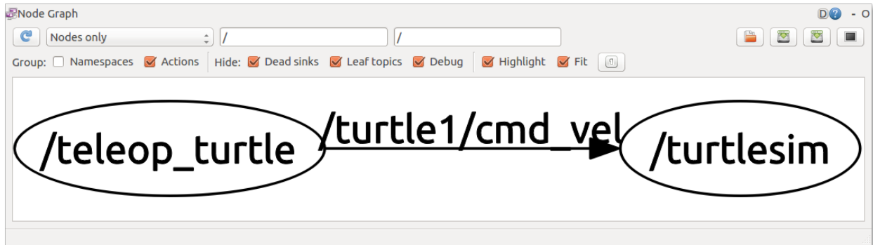
Figure 2: Output of rqt_graph when running turtlesim .

This should produce an illustration like Figure 2. In this example, the teleop_turtle node is capturing your keystrokes and publishing them as control messages on the /turtle1/cmd_vel topic. The turtlesim node then subscribes to this same topic to receive the control messages.