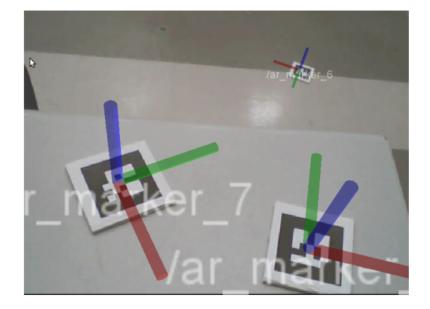
Figure 5: Tracking AR Tags with webcam

From the Displays panel in RViz, add a "Camera" display. Set the Image Topic of the Camera Display to the appropriate topic (/usb_cam/image_raw for the starter project), and set the Global Options Fixed Frame to usb_cam. (Note: you may need to place an AR tag in the field of view of the camera to cause the usb_cam frame to appear and for the Camera display to show an image.) You should now see a separate docked window with the live feed of the webcam. Finally, add a TF display to RViz. At this point, you should be able to hold up an AR Tag to the camera and see coordinate axes superimposed on the image of the tag in the camera display. Figure 5 shows several of these axes on tags using the lab webcams. Making the marker scale smaller and disabling the Show Arrows option can make the display more readable. This information is also displayed in the 3D view of RViz, which will help you debug spatial relationships of markers for your project. Alternatively, you can display the AR Tag positions in RViz by adding a Marker Display to RViz. This will draw colored boxes representing the AR Tags.